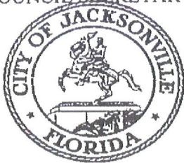
LENNY CURRY, MAYOR